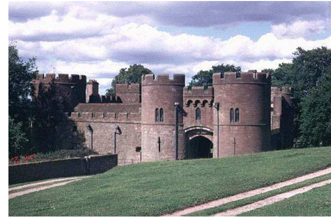
Pembridge Castle

Membership of the Garway Heritage Group is open to all. Regular meetings are held at which Speakers give talks on interesting Heritage related subjects. Information is also provided on current and forthcoming activities and events.