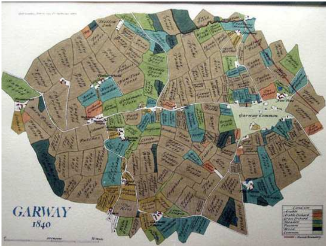
Part of the 1840 Tithe Map of Garway Parish by Geoff Gwatkin