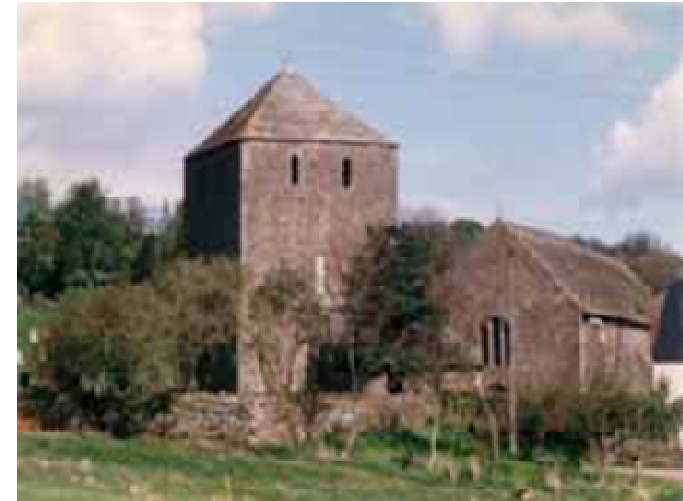
St Michaels' Church, Garway